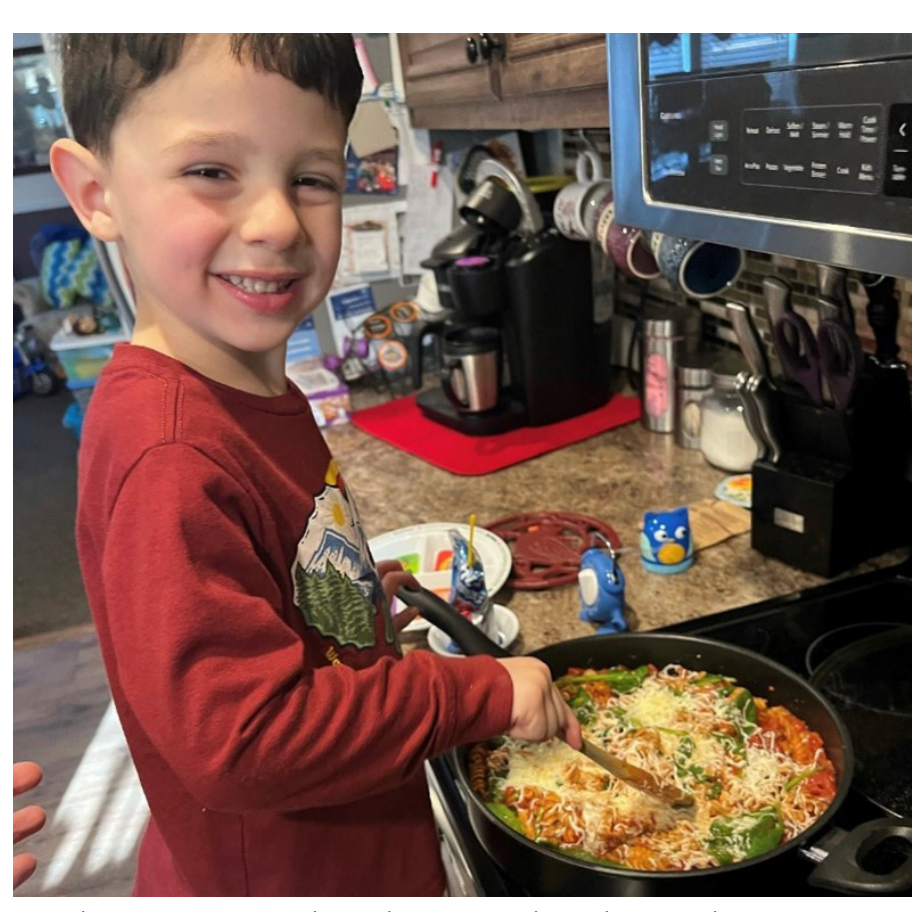
An enthusiastic Suppers Made Simple participant learns how to make healthy and cost-conscious meals at home.