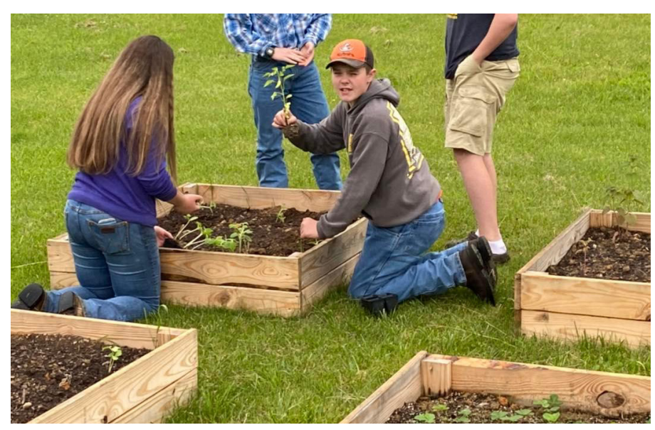
4-H members assist with planting in the community garden.