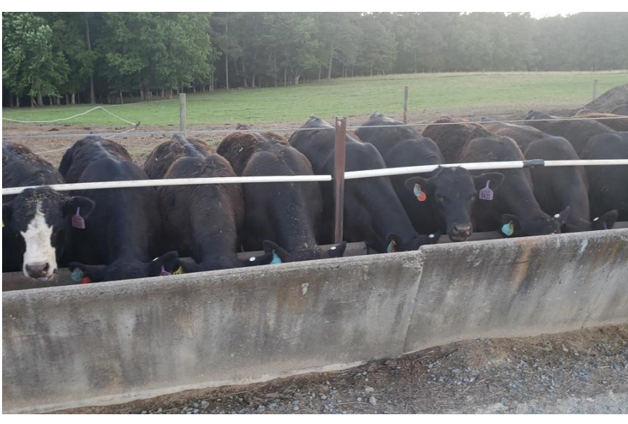
Virginia Quality Assured steers eating and growing at the feed bunk.