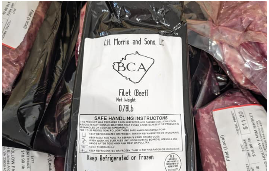
Buckingham beef from C.H. Morris and Sons LLC for sale at Spring Hollow Market.