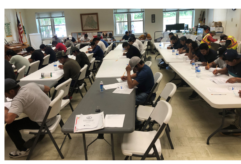
Participants attend a Spanish language pesticide class.