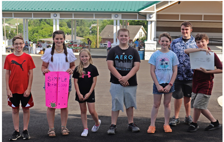
2023 Youth Entrepreneurship Program participants.