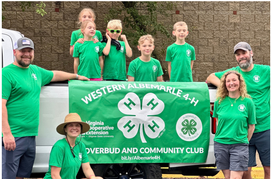
Members of the Western Albemarle 4-H Club participate in the Crozet Independence Day Parade.