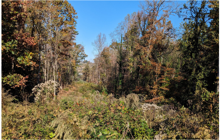
One section of Ballou Park where trees had to be removed due to a burst underground water pipe.