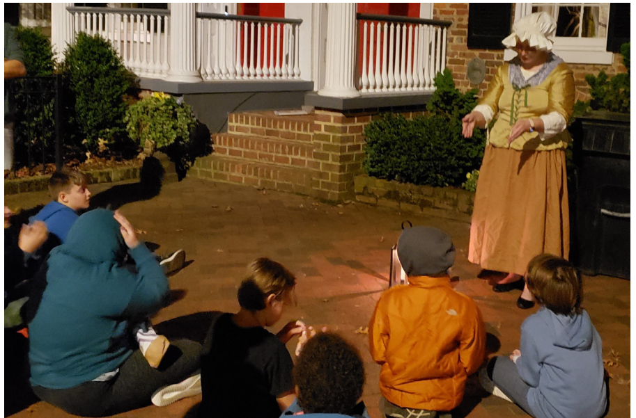
The Alexandria Nature and Animal 4-H Club participates in Alexandria’s Ghost and Graveyard Tour during their October club meeting.