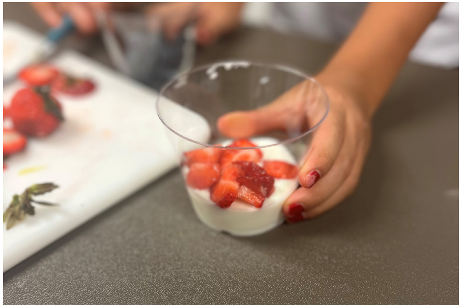
Youth in Fairfax County prepare yogurt parfaits.

Co-Chair, Environment and Parks Committee, Great Falls Citizens Association