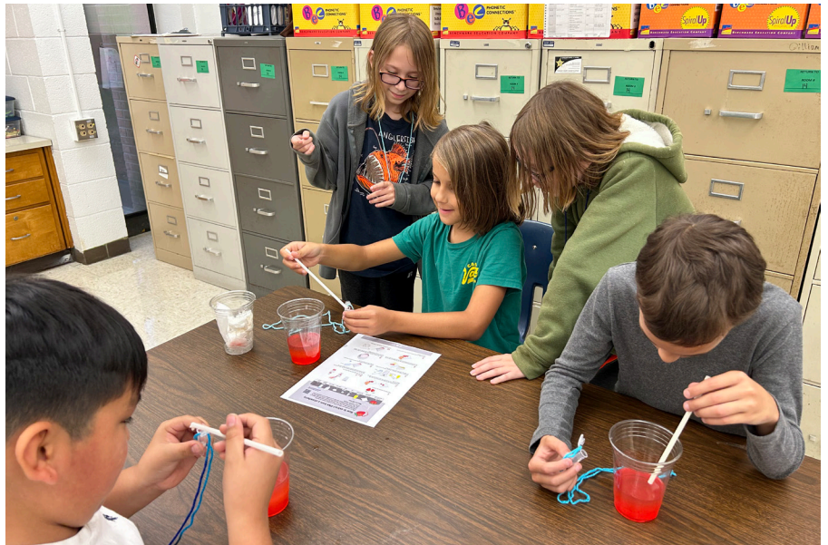
Students work together to extract DNA from strawberries as part of the All About Ag series.

Executive Director, Fauquier County Food Bank