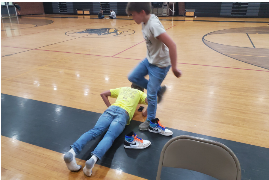
Floyd County eighth graders participate in a Health Rocks! activity where they experience what it would be like to have reduced lung capacity as a result of smoking.