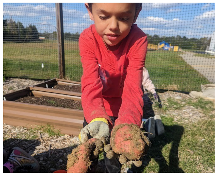
Carysbrook Elementary School youth harvest sweet potatoes after school for donation to the local food bank.