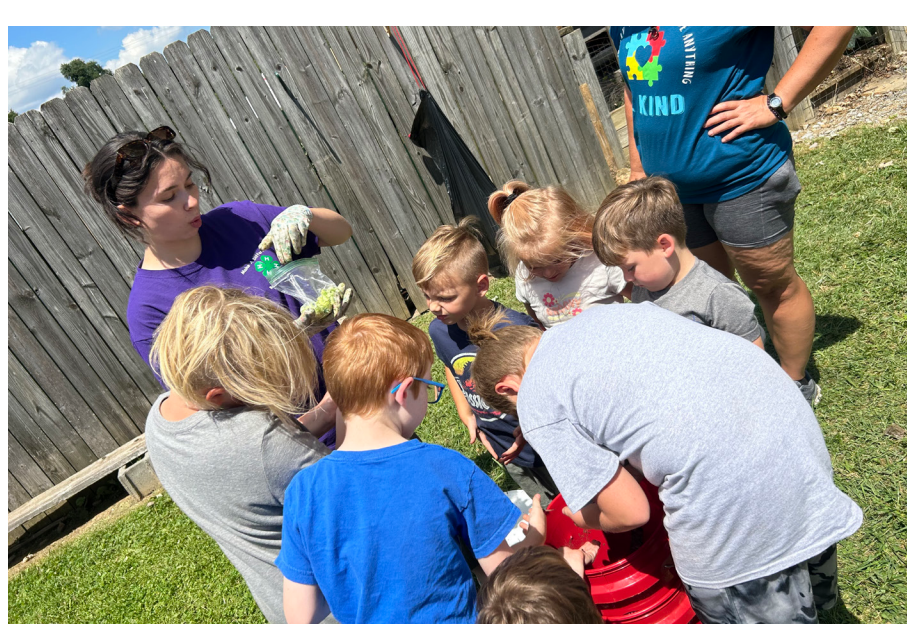
Participants of the Summer Garden Program learned about vermicompost and how worms benefit soil.