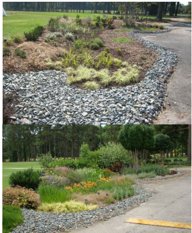
Figure 3. Top, newly planted rain garden; bottom, after three years.

Space the plants according to their mature size. Groundcovers and perennials should be spaced so their canopies will grow together and cover the ground quickly to minimize weeds and mulching. Shrubs should be planted so their mature canopies will touch but not grow together and compete. For example, inkberry shrubs that grow 4 feet wide should be planted 4 feet apart on center (see figure 3).