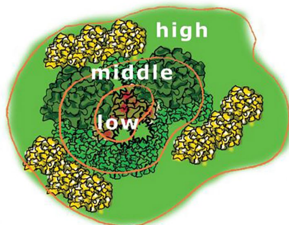
Figure 1. Cross section and overview of a typical rain garden.