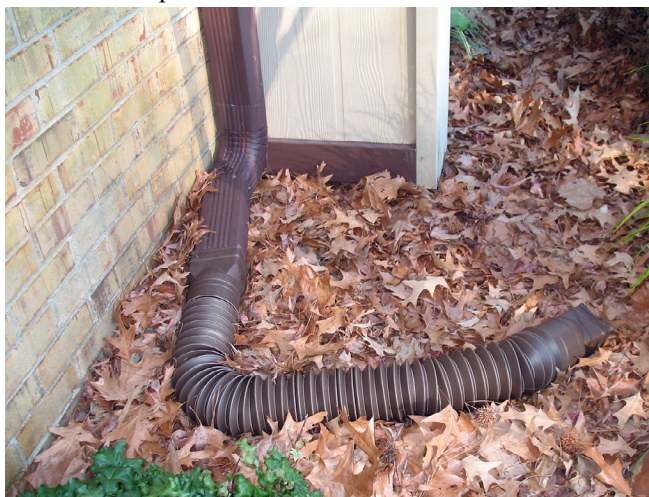
Figure 2. Example of a downspout with a flexible extension pipe. Direct the runoff 10 feet away from the foundation and into the landscape.

Rain gardens can be located anywhere along the natural runoff pathway. If the garden can't be located along the natural water pathway, runoff can also be directed into a rain garden (through pipes or swales) (see fig. 2). Rain gardens can be in sun or shade and should be located at least 10 feet away from building foundations, not on steep slopes, not over underground utilities or a septic field, not where soil clay content is high, and not where the water table is high. The bottom of the rain garden should be at least 2 feet above the seasonal high water table level to promote infiltration.